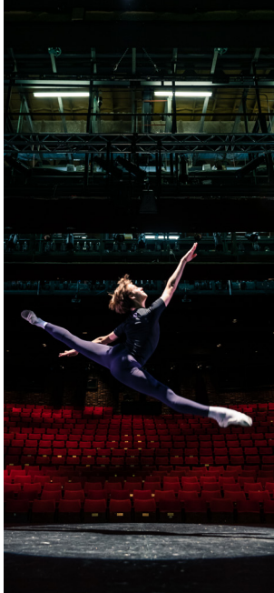
Main House (2019)

There will be dedicated space for training in theatre-making, our work with young people, our referral partnerships for health and wellbeing, and events and catering spaces to help increase revenue generation.