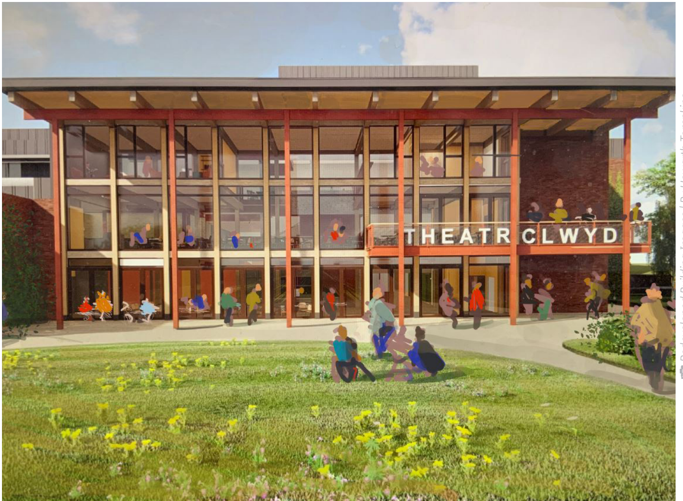
Redeveloped Building Images | By Howarth Tompkins