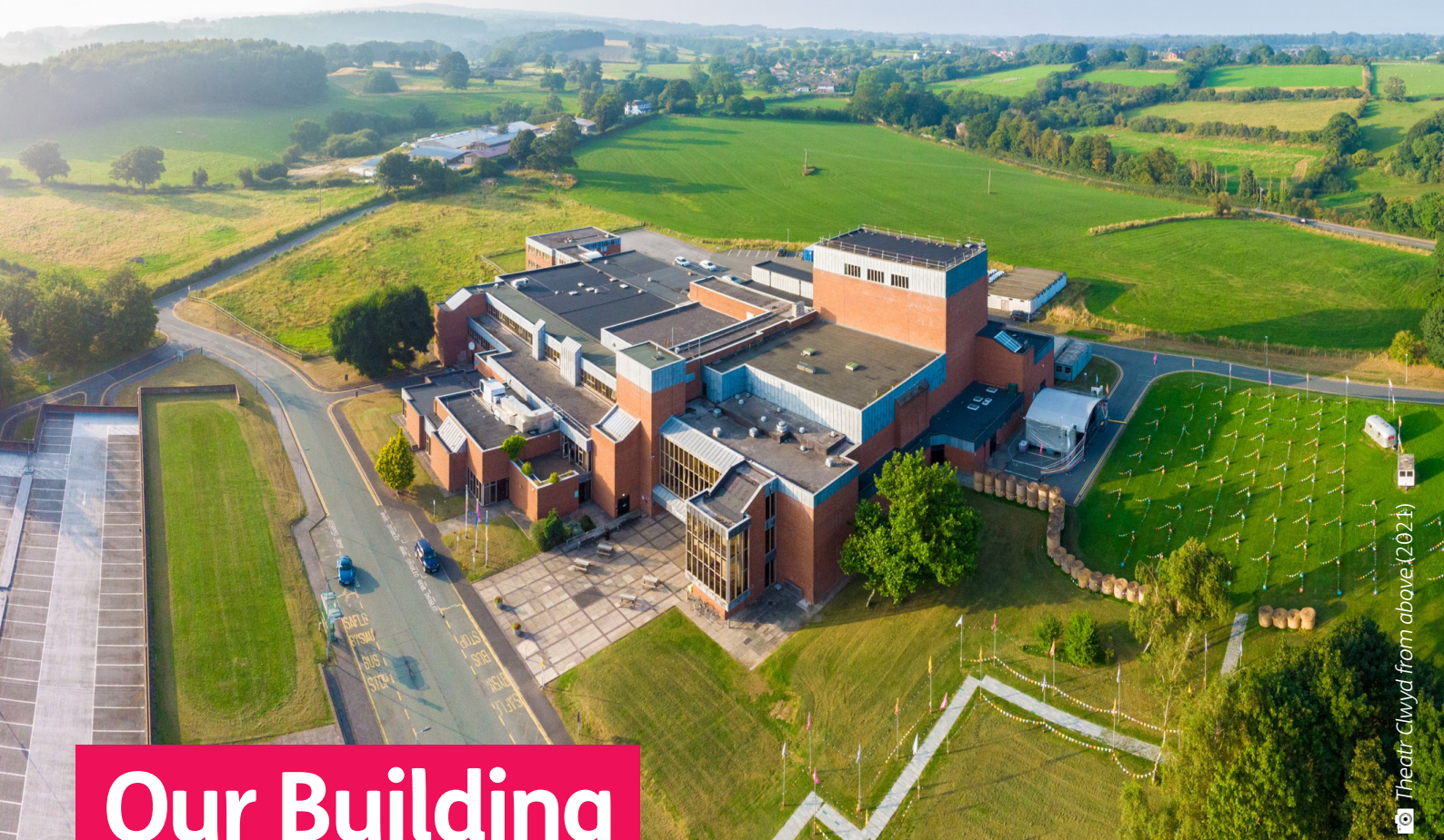
Theatr Clwyd from above (2021)