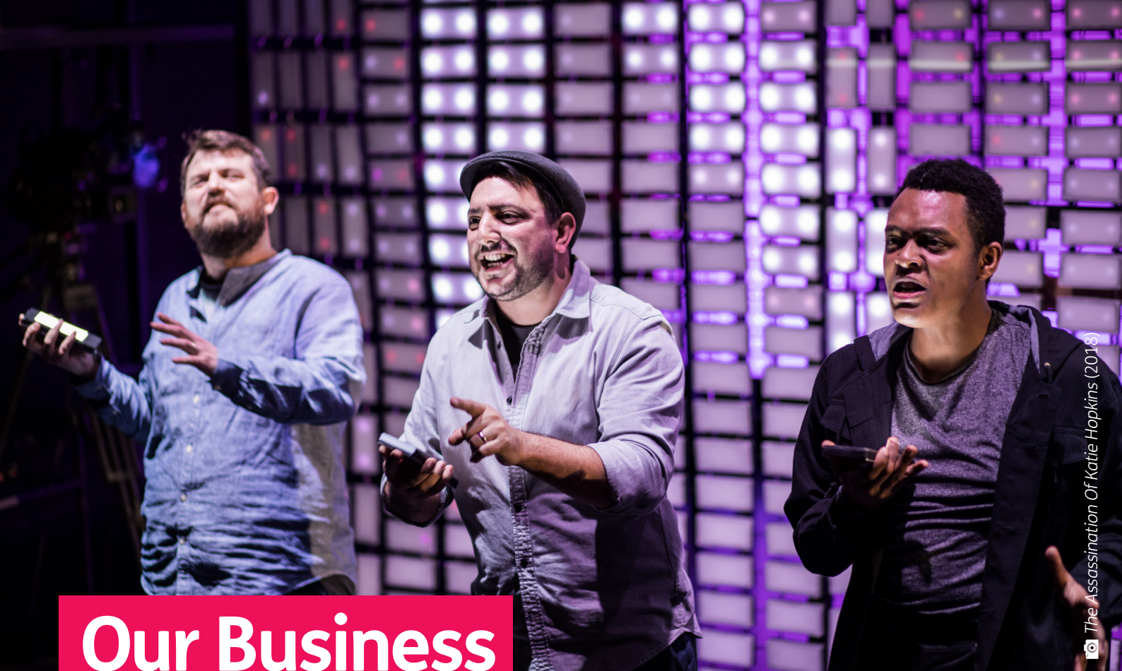
The Assassination Of Katie Hopkins (2018)