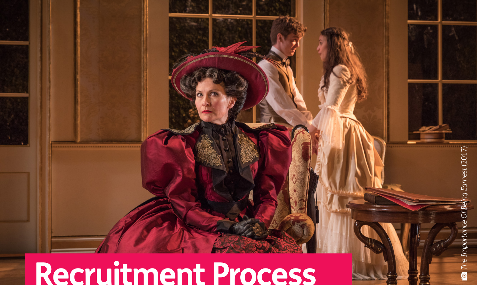
The Importance Of Being Earnest (2017)