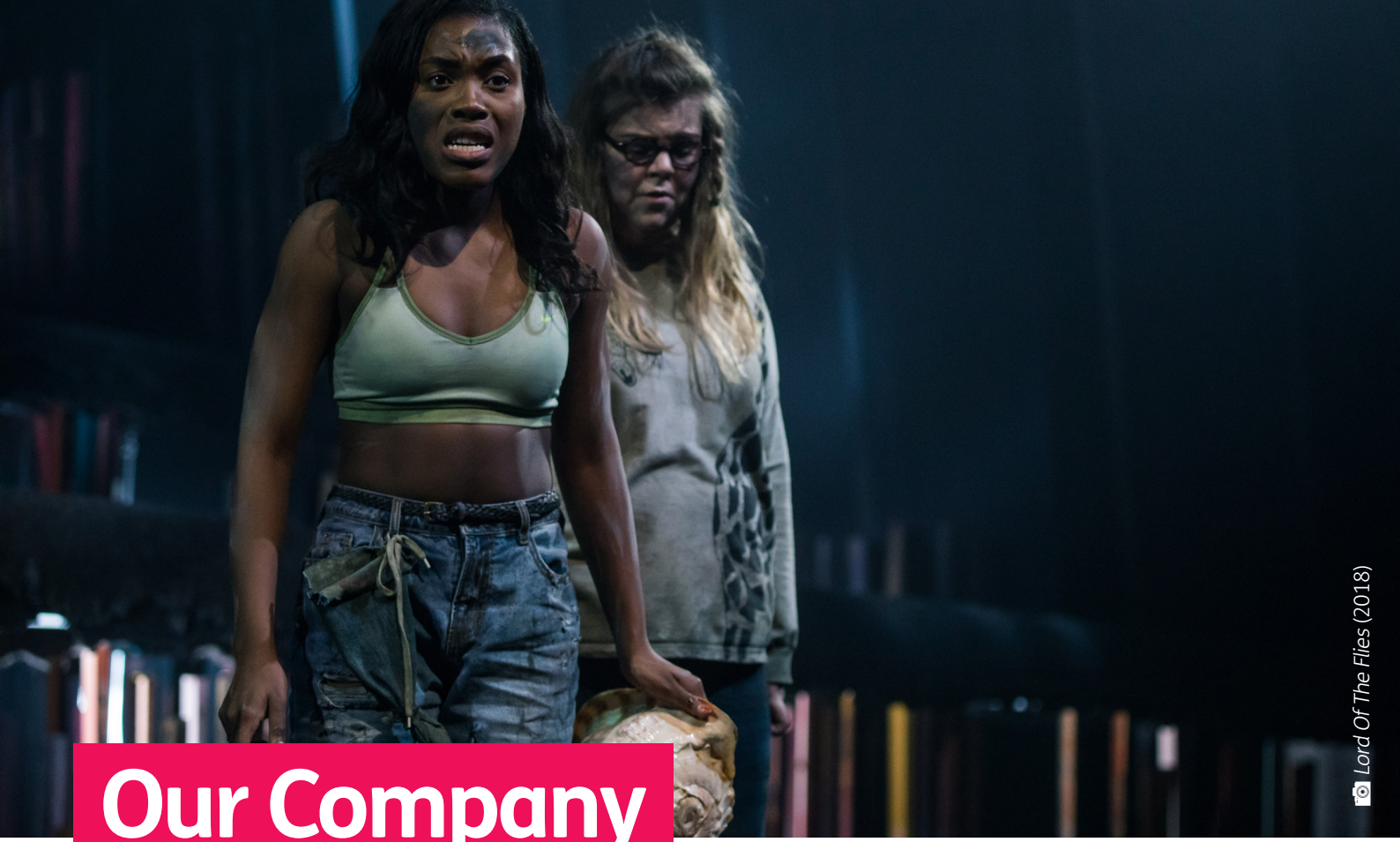
Lord Of The Flies (2018)