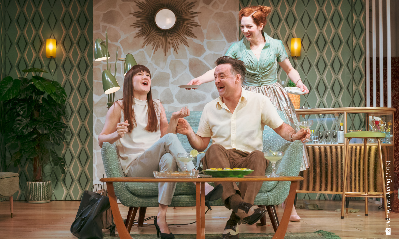
Home, I'm Darling (2019)