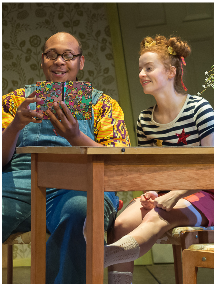
To Dream Again (2016)

We are one of few theatres in the UK to still have scenic construction, costume making, props, and scenic art teams all in-house alongside the lighting, sound, and stage teams. We always aim to offer the warmest environment for creative teams to produce their best work.